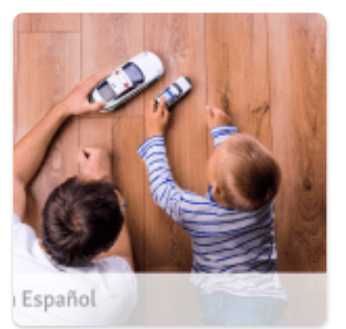
When Parent and Child Both Have ADHD