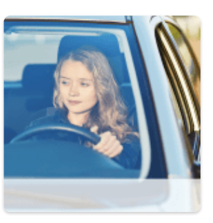
How to Help Kids With ADHD Drive Safely